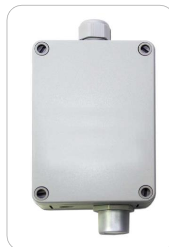
Option housing "A" with sensor unit in plastic housing