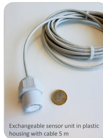
Exchangeable sensor unit in plastic housing with cable 5 m