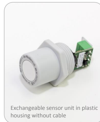
Exchangeable sensor unit in plastic housing without cable